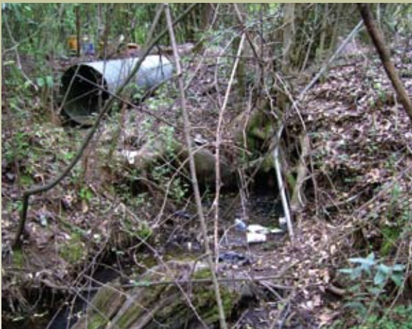
Debris and trash in the upper reaches of Town Branch is harmful to water quality and aquatic life.