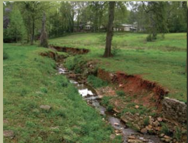
Lack of a vegetative buffer can cause severe stream bank erosion, as shown here along Bell Creek.

A watershed is an area of land that drains to a stream. Each stream has its own watershed. Thomaston Water and Wastewater Management has conducted watershed assessments to determine water quality and biological conditions for streams within the City of Thomaston. This includes the Bell Creek, Potato Creek, and Town Branch watersheds. The map below presents the study area within City of Thomaston. Water and Wastewater Management has investigated water quality, stream habitat, and other conditions that impact stream health. They have documented conditions and identified protection measures to address existing and future impacts on the streams. Information obtained from the watershed assessment was used to develop a Watershed Protection Plan that outlines strategies for long-term water quality protection.